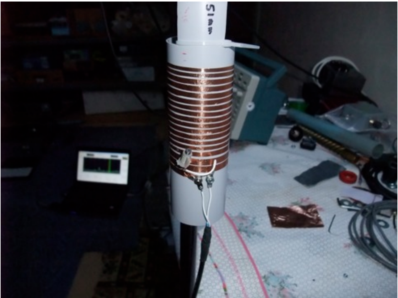
EH antenna phase test experiment

The input frequency was changed to 11MHz and 17MHz during the tests, as noted. The coil tap was made using a flying lead as shown in the next photo. Initially the source coil was not inserted, which is shown in the next photo: